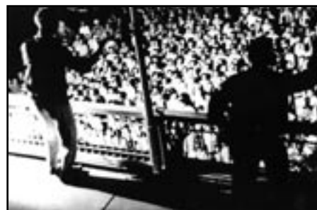
Rice University Pep Rally in front of the Rice Hotel