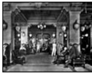
The Rice Hotel's Magnificent Lobby