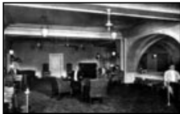
The Rice Hotel Mezzanine