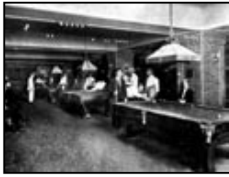
The Billiard Room at the Rice Hotel

Crowell to design the new hotel, erected in the form of a "C", with two parallel wings jutting out from the main building. Texas Architecture noted in an article about the Rice Hotel that it was considered at the time the keystone in a campaign to reshape the low-scaled Victorian downtown into something more modern. When it opened in May of 1913, it actually did become a sort of