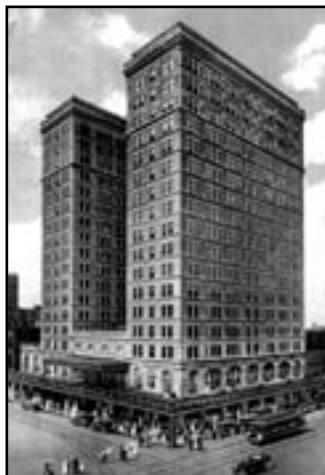
Rice Hotel, 1914