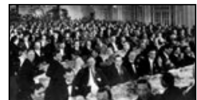
The Rotary Club Banquet, Given in the Ball Room; the First Service of the New Rice