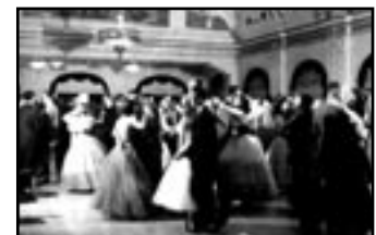
1950s Rice Dance Crystal Ballroom

When Jesse Jones died in 1956, the hotel went to his charitable foundation, Houston Endowment, which continued to operate the hotel. A year later the Empire Room was converted to the Old Capitol Club and the Flag Room, which would operate for the