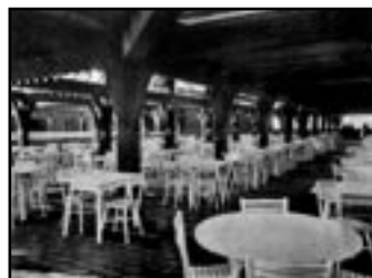
Rice Hotel's Roof Garden

So not only did the institute lease the land to Jones for a new Rice Hotel, but