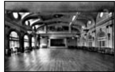
The Crystal Ballroom