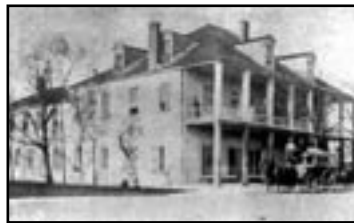
Capitol Hotel, 1837