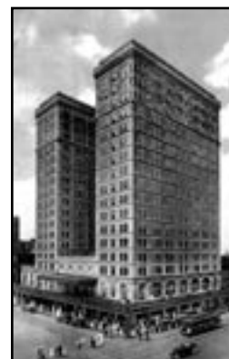
Rice Hotel, 1914