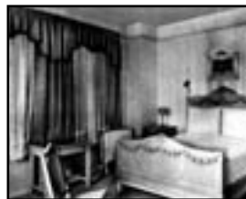
Bridal Suite, Rice Hotel