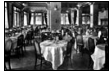
Rice Hotel Dining Room

In 1940 the Rice became the first hotel in Houston to make extensive use of fluorescent lighting and plastic upholstery. The two-story lobby was closed to make more space on the mezzanine level and remained a one-story space