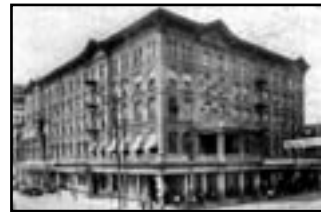
Capitol Hotel, 1882