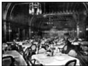
The Rice Hotel Grill