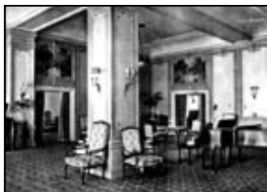
The Ladies' Parlor at the Rice Hotel

Jesse Jones made a proposal to the Rice trustees to lease the site and build a new hotel. In 1900 three events had occurred that had a significant impact on Jones's life. The 1900 census showed