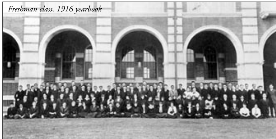
Freshman class, 1916 yearbook