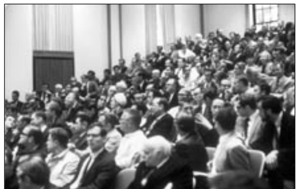
Rice faculty meeting, February 21, 1969